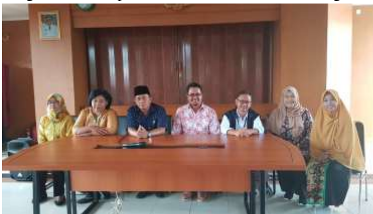
Figure 3 The Implementation of Socialization Program

Besides, ownership-based on Figure 2 ownership of Islamic bank accounts is only owned by housewives aged 36-45 years. This shows that not many homemakers have accounts from Islamic banks, which is 10% of the total homemakers present at the socialization program (table 4). The outreach activities went well, and all participants responded that the E-Commerce outreach program to help sell their products and services was very useful. Empowering homemakers who have hobbies and can commercialize their products and services that aim to increase their sales turnover and need to improve the quality and appearance of the packaging of products and services as portrayed on Figure 3.