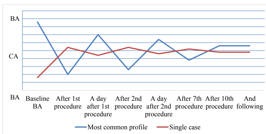
Fig. 2. Averaged profile of reactions of nuclei of the buccal epithelium to the effects of NM devices (by electronegativity (ENN, %): CA – chronological (passport) age; BA – biological age (by % of electronegativity of nuclei of the buccal epithelium)

Studies have shown that the response of the subjects to exposure by different devices in terms of the ENN index, % is similar, but substantially depends on the initial values of the ENN index, %, shown in Fig. 2 .