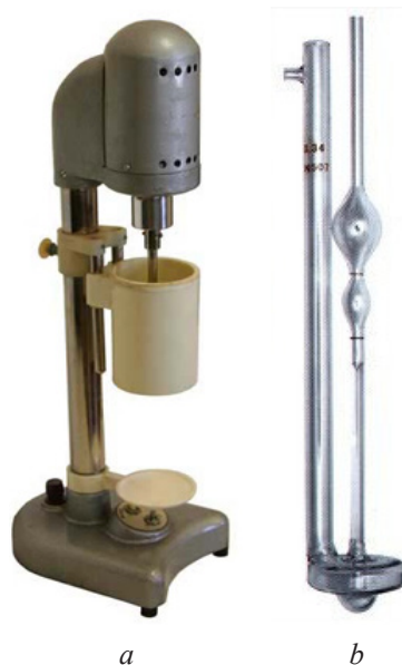
Fig. 1. The types of equipment, used during the study: a – micro-shredder of tissues RT-1; b – viscosimeter VTL-2 with capillary diameter 0,56 in water thermostat

After that the reactive mixture was filtered and kinematic coefficient of filtrate viscosity was found by capillary viscosimeter VTL-2 (“Oilchemigroup, LTD, laboratory equipment, Kyiv city, Ukraine) with capillary diameter 0,56 in water thermostat ( Fig. 1, b ) [12].