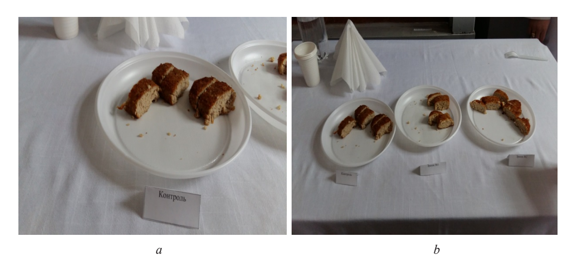
Fig. 4. Tasting of functional cutlets: a - look of control cutlets; b - look of elaborated samples

Having analyzed all parameters by correspondent criteria, the highest results were established, 12 experts took part in the experiment.