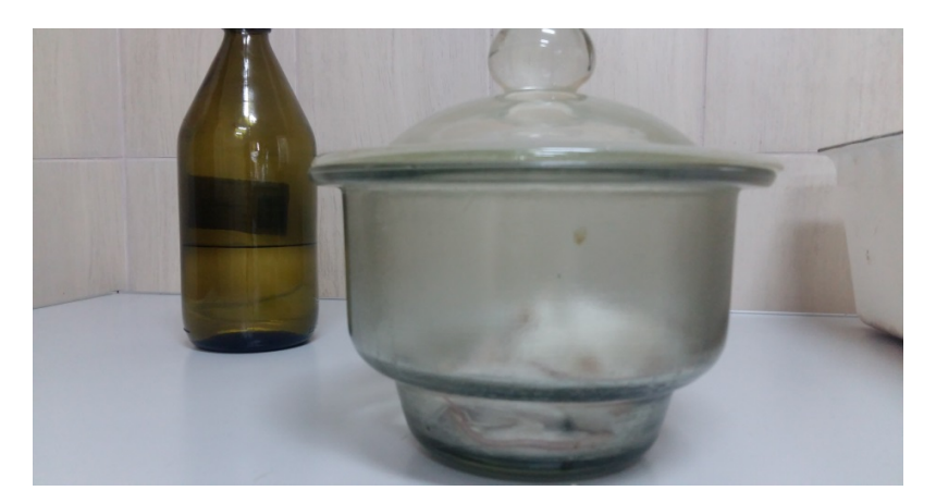
Fig. 2. Pouring of laboratory mice

The toxicity was assessed by the following criteria: