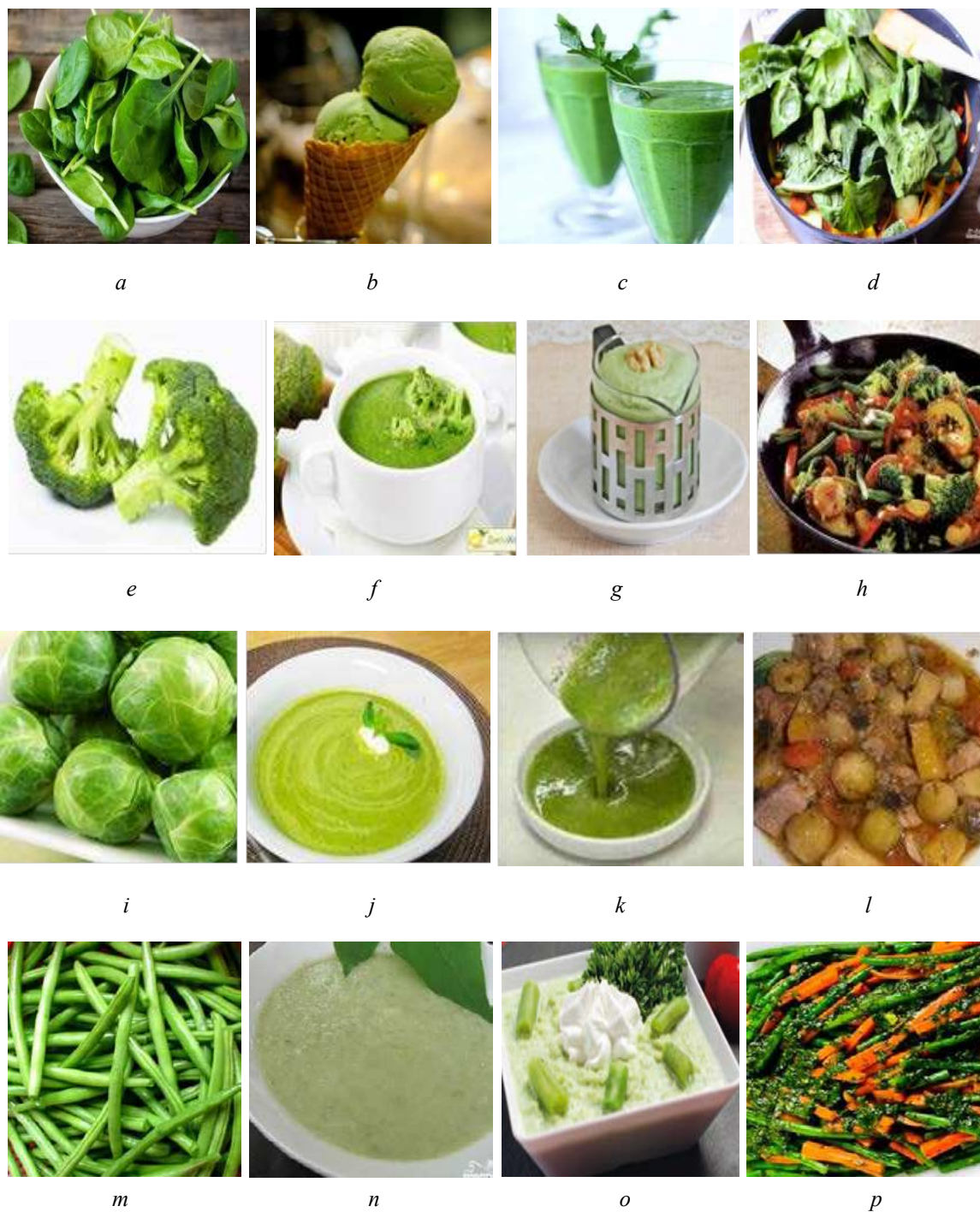
Fig. 3. Chlorophyll-containing vegetables and healthy nanoproducts of them: a, b, c, d – fresh spinach ( a ) and healthy product of it: sorbets ( b ), nanodrinks ( c ), soup-puree ( d ), e, f, g, h – fresh broccoli ( e ) healthy products of it: soup-puree ( f ), sauce-dressing ( g ), vegetable ragout ( h ); i, j, k, l – fresh Brussels cabbage ( i ) and healthy products of it: soup-puree ( j ), sauce-dressing ( k ), vegetable ragout ( l ), m, n, o, p – fresh leguminous haricot ( m ) and healthy products of it: soup-puree ( n ), sauce-dressing ( o ), vegetable ragout ( p )