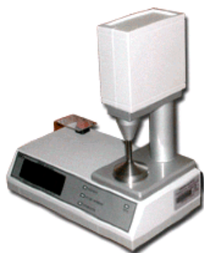
Fig. 1. Photo of the measurer of gluten deformation MGD-7 (produced by Ukraine)

For assessing the density of connection between parameters, there was used R. E. Chaddock scale [12], that is weak at correlation coefficient value 0,1–0,3, 0,3–0,5 – moderate, 0,5–0,7 – essential, 0,7–0,9 – high, 0,9–0,99 – very high. The mathematical processing of data was conducted by the method of one-factor dispersion analysis [13].