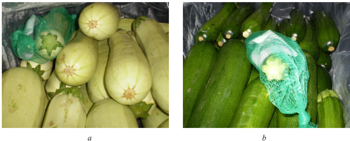
Fig. 1. Refrigeratory storage of bush pumpkins: a – Kavili F1; b – Tamino F1

terized by the high heat supply: annual sum of temperatures higher than 10 °C is 3400...3600. And humidity is the least in Ukraine: the annual hydrothermal coefficient (HTC) is 0,5...0,7 units) [7]. So, at planting all fruit vegetables, drop irrigation was used. The spray norm within 30–90 m 3 /ha, in separate cases – 110–130 m 3 /ha was observed.