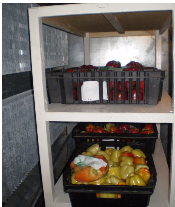
Fig. 2. Refrigeratory storage of sweet pepper Nikita F1 and Hercules F1

Peppers and tomatoes were submerged in solutions of antioxidant compositions with the temperature 45 °C for 15 min. Tomatoes were stored at 2±1 °C, relative humidity of air 90±3 %. Peppers – at 7,0±0,5 °C at the relative humidity 95±1 % ( Fig. 2 ).