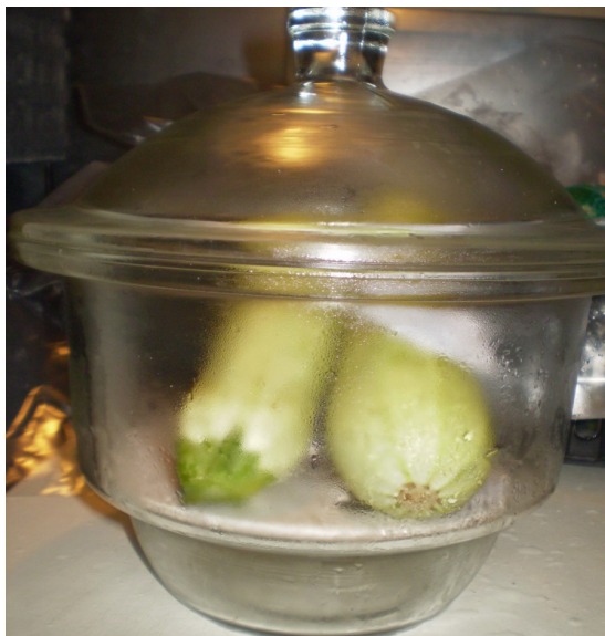
Fig. 3. Determination of vegetables respiratory rate by Tolmachev's method

The respiratory rate (RR) in mg of CO 2 /kg×hour was determined by Tolmachev's method [13] (Fig. 3).