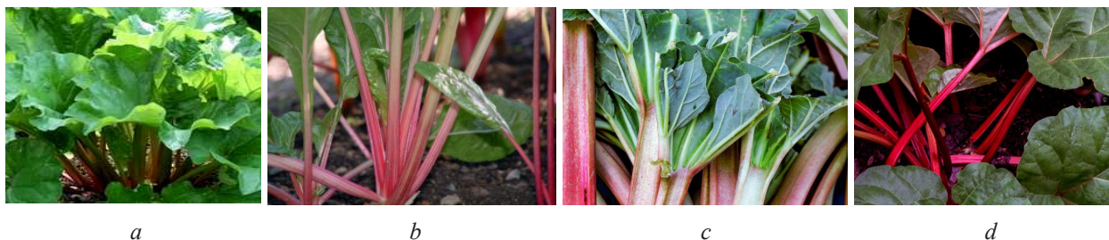
Fig. 2. Rhubarb of the varieties: (a) Monarch; (b) Linney; (c) Krupnochereshkovyy; (d) Ogrski