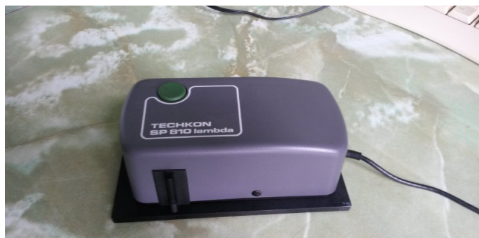
Fig. 4. Spectrophotometer Techkon SP-810

This model is the closest to the perception of an actual observer. We measured spectra of the diffuse reflection of experimental samples using the spectrophotometer Techkon SP-810 (Techkon, Germany) in the range of 400...700 nm in a step of 10 nm and the number of cycles of accumulation of 20 (Fig. 4).