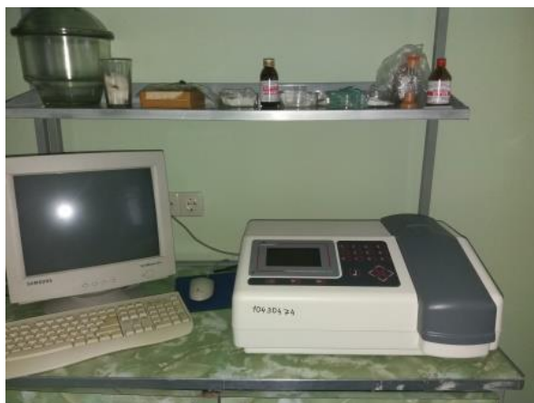
Fig. 3. Spectrophotometer SF-103

This model is the closest to the perception of an actual observer. We measured spectra of the diffuse reflection of experimental samples using the spectrophotometer Techkon SP-810 (Techkon, Germany) in the range of 400...700 nm in a step of 10 nm and the number of cycles of accumulation of 20 (Fig. 4).