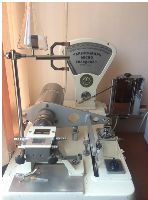
Fig. 1. Farinograph “Brabender”

«Brabender» farinograph, used for the study of structural-mechanical properties of the dough at mixing, is presented on the Fig. 1 .