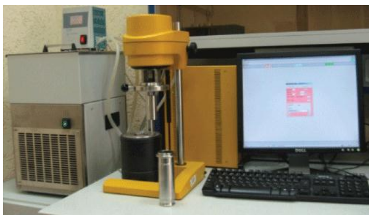
Fig. 3. Rotary viscosimeter Rheotest RN 4.1

The study of rheological characteristics of dough ( Fig. 3 ) (effective viscosity and shift tension) was carried out on the rotary viscosimeter Rheotest RN 4.1., made by «RheoTest Messgerate Medingen GmbH», Germany.