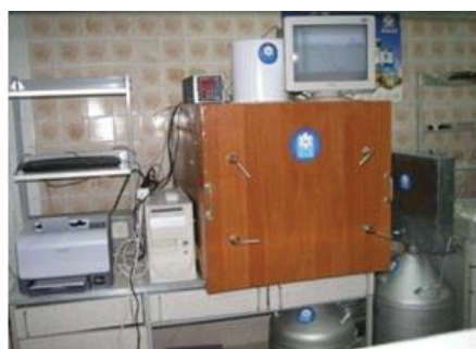
Fig. 1. Cryogenic program freezer

The preparation of samples for the study of cryogenic processing of raw material (freezing) and fine-dispersed grinding was carried out as following.