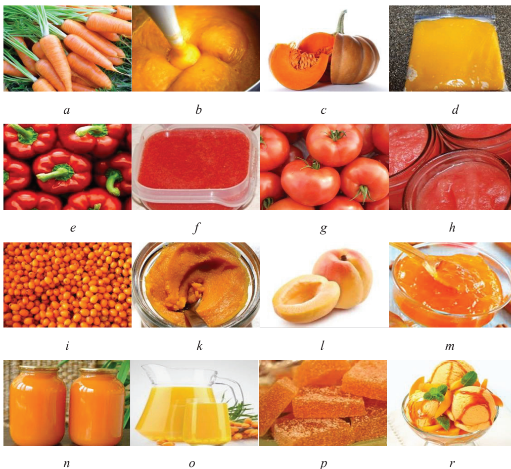
Fig. 2. Objects of research: a – carrot; b – cryopuree of carrot; c – pumpkin; d – cryopuree of pumpkin; e – sweet pepper; f – cryopuree of sweet pepper; g – tomato; h – cryopuree of tomato; i – sea buckthorn; k – cryopuree of sea buckthorn; l – apricot; m – cryopuree of apricots; n, o – carotenoid nanojuices; p – carotenoid jelly; r – carotenoid nanosorbets

Carrot, pumpkin, sweet pepper and tomato were cut in pieces with width 0,5...1,0 cm and length 4...5 cm, then put in plates for further freezing. Berries were frozen wholly, without grinding.