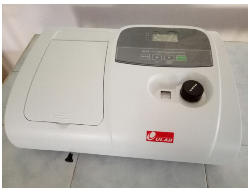
Fig. 2. Ulab 101 spectrophotometer (China)