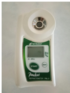
Fig. 1. PAL-3 refractometer (Japan)

In fresh raw materials and canned processing products, the mass fraction of dry soluble substances (DSS) according to DSTU ISO 2173:2007 [13] was determined using a laboratory refractometer ( Fig. 1 ), sugars according to DSTU 4954:2008 [14] using a spectrophotometer ( Fig. 2 ), titratable acidity in terms of malic acid according to DSTU 4957:2008 (GOST ISO 750) [15], active acidity according to DSTU 6045: 2008 in units of pH (DSTU ISO 1842) [16] m ( Fig. 3 ), the content of ascorbic acid in accordance with GOST 24556-89 (DSTU ISO 6557-2) [17] using a spectrophotometer ( Fig. 2 ).