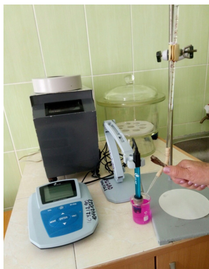
Fig. 3. Laboratory pH meter, model MP511