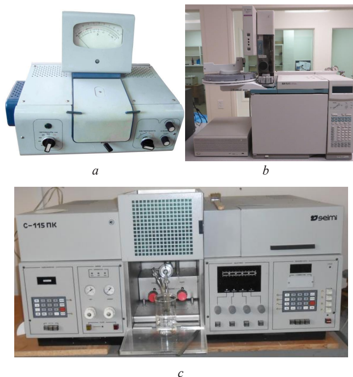
Fig. 2. Devices for conducting the experiments: a – photocolorimeter CPC-2 (“Zagorsk optical-mechanical plant”, Russia); b – gas chromatograph HP 6890 («Hewlett Packard», USA; c – spectrophotometer S-115 PC (PC «Electron», Ukraine)

For obtaining the reliable values of experimental data, all studies were conducted no less than three times, making two parallel determinations at each experiment.