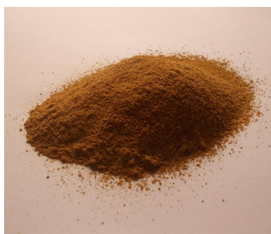
Fig. 1. Aubergine powder [6]

The devices for conducting the experiments are presented on Fig. 2 .