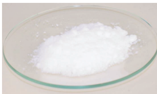
Fig. 2. Nanocomposite, silica (food additive E551)

The recipe of boiled sausages (of first quality) according TS U 15.1-20021369-005:2007 that includes: beef of second quality, semi-fatty pork, meat of bird (red chicken meat), lard (brisket), flour, blend, salt and spices was taken as a control. On its base were elaborated the recipes of studied samples of boiled sausages, in which the meat raw material was replaced by the correspondent quantity of hydrated FFC (20, 30 and 40 %). In the recipe № 1 10 % of lard and 10 % of beef of second quality was replaced by 20 % of hydrated composition. For the recipe № 2 10 % more of composition was additionally introduced instead of analogous quantity of chicken meat. For the studied samples according to the recipe № 3 10 % more of red chicken meat was replaced by composition. The studied samples of meat minces were produced according to the technology that includes comminution of recipe components to the creation of homogenous mass, typical for boiled sausages [14]. The elaborated FFC was added at the stage of cuttering after salt fatless raw material, sodium nitrite (as 0,5 % solution), phosphates with introduction of additional water in quantity 20 % of the main raw material.