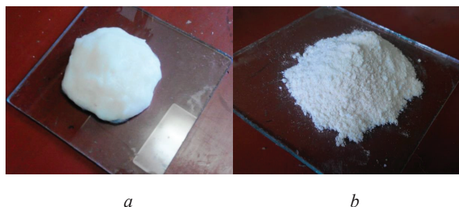
Fig. 1. Protein-containing functional food composition: a – hydrated; b – dry

The studies [8, 9] established the rational degree of composition hydration at the level 1:20 that provides the necessary properties of gels. Hydration was carried out by water at temperature 10 \pm 2 °C with silica introduction in quantity 0,3 % of the gel mass. There was used the silica, synthesized by the specialists of department of amorphous structures and structurally ordered oxides of the institute, named after A. A. Chuyko, NAS of Ukraine (city Kyiv, Ukraine) with specific area of surface S_{\text{bet}} = 232 \text{ m}^2/\text{g} , with correspondent middle radius of initial nanoparticles 5,88 nm and poured density \rho_0 \approx 22 \text{ g/cm}^3 [10, 11]. The expedience of introduction of this food additive (E551) is proved by the researches of determination of its influence on the properties of milk proteins [12] and protein preparations [8, 9, 13].