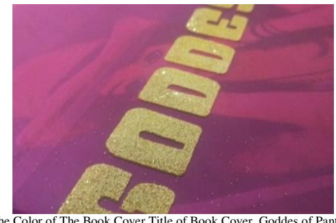
The Color of The Book Cover Title of Book Cover Goddes of Pantura

Using a yellow color as the color of the book title of Goddes of Pantura book, this color is combined and adjusted to the color of the book cover to give the impression of harmony, composition and aesthetics so that the use of color can convey a good visuals. Besides that, the use of yellow color can also convey the image of pleasure, happiness which is also a great energy, but on the other hand yellow color also convey a sign of sadness and a sign of caution. This image can be