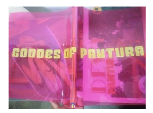
Book Cover Color Goddes of Pantura

The color that used on cover Goddes of Pantura book is one type color that originally from the color of the used material. By using a pink color, cover Goddes of Pantura book has a pretty striking visual with the use of these colors as a very dominant cover color. The pink color provides a strong identity for the Goddes of Pantura book, because the pink color gives an image that is closely related to feminine, romantic or conveying intimate images. Pink also perceives a thing that is sentimental, exciting or encouraging because the color is a fairly bright color.