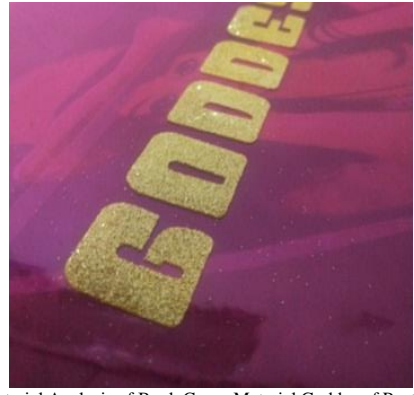
Material Analysis of Book Cover Material Goddes of Pantura

On the book title part at cover Goddes of Pantura book, the book title displayed by a special material in the form of gold-colored glitter which affixed to the printing process of the title of the book. The use of glitter at the book title give a glamour impression that evoke an atmosphere full of sparkling and luxury.