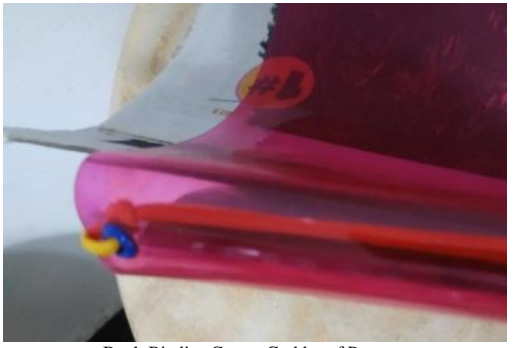
Book Binding Cover Goddes of Pantura

The Goddes of Pantura book uses a binding technique. The binding that used in the book uses yellow elastic rubber thread. The technique of binding the book by sewing one time directly and binds the center of the contents of the book and then tied up to the ends of the two books, the binding techniques that used is unlike normal sewing bindings, thus giving a more dynamic image and free movement when the book page is opened. The use of yellow elastic rubber thread as bindings is also adjusted to the composition and aesthetics contained in the cover so that it is looked visually good when the reader sees the book.