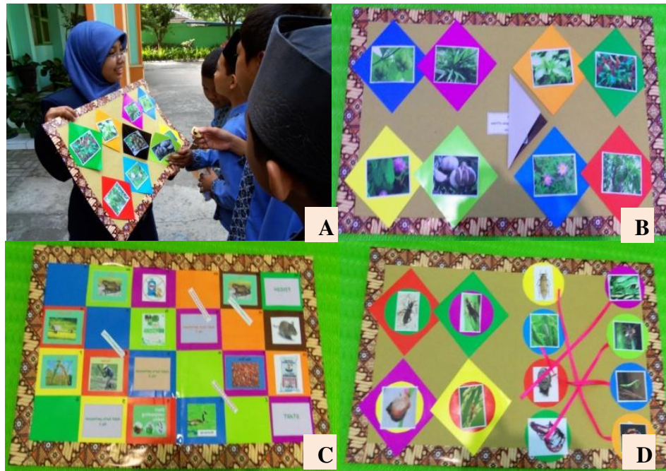
Figure 2. Eco-games at agroedutourism program (A) predator and prey as well as guest animal name and its role (B) snake and aldder and study healthy agroecosystem (C&D) guest plant name and its function

Although agroedutourism could improve students's understanding but the understanding of each school students were not same. This difference showed that understanding level of agroedutourism program that accepted by each students were not same. It was due to differences of environmental factors, intelligence level and students' attention to agroedutourism program. There are two factors that influenced student learning outcomes, namely internal factors and external factors. Internal factors include motivation, attention and the students response in activity, while external factors were environmental and family factors [10]. Before agroedutourism, the highest cognitive competence, affection and appreciation was students of SDN Sumbergepoh 02, following by students of SDN Ketawanggede 2 and students of SDI Surya Buana, as well as cognitive competence, affection and appreciation of the students after agroedutourism.