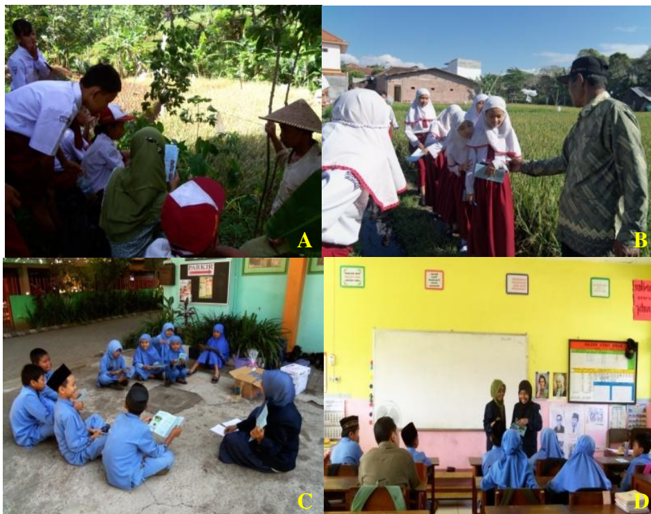
Figure 1. Argoedutourism programe at three different location (A&B) field, (C) school yard and (D) class

Before agroedutourism program, average value of three elementary school students's cognitive competencies ranged between 1- 1.38; affection between 3.48 - 4.12 and appreciation between 3.44 - 4.10. After agroedutourism program average value of students cognitive competence increased be 1.76 - 1.85; affection be 3.88 - 4.77 and appreciation be 3.80-4.74 (Figure 3). It showed that agroedutourism effective to improve students's understanding.