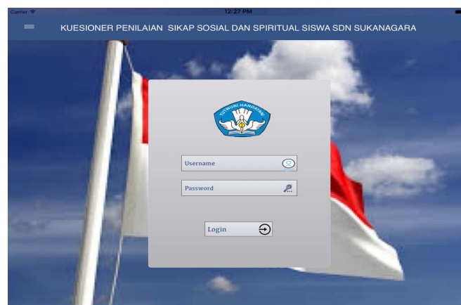
Picture 2. Prototype Login View

To be able to operate the system a respondent or teacher has access to enter the login by entering a username or password.