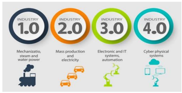
Figure 2. Industrial Revolution

The industrial revolution is a fundamental change in the way of life and human work processes. It first appeared in the 1750s, this is what is commonly called the Industrial Revolution 1.0. The Industrial Revolution 1.0 lasted between 1750-1850. At that time there was a massive change in the fields of agriculture, manufacturing, mining, transportation and technology and had a profound impact on the social, economic and cultural conditions in the world. The 1.0 generation revolution gave birth to history when human and animal power was replaced by the appearance of the engine. One of them was the emergence of a steam engine in the 18th century.