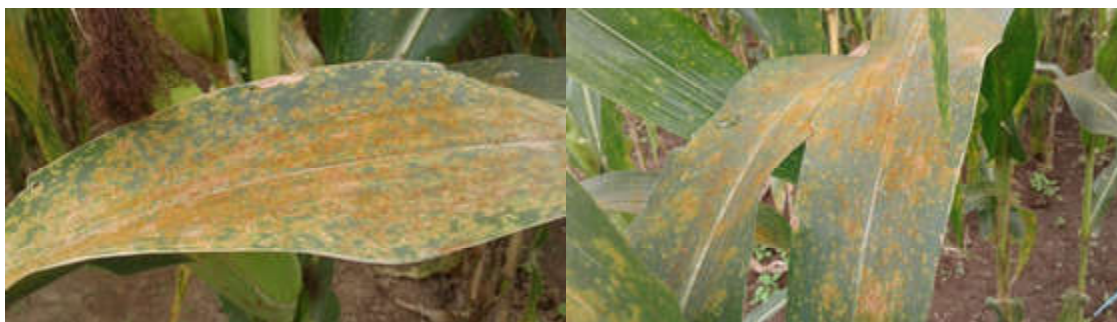
Figure 1. The symptom of rust on maize leaves

Accession of maize germplasm with highest density of stomata is the one with number 173, and it is significantly different higher than stomata density of both control varieties (Figure 2). Some other accessions have value of stomata density that are not significantly different to the same value of susceptible comparison variety (Table 3). Table 3 showed that rust severity of some accessions were significantly different to those on Bima 10 variety that had also significant difference of stomata density. It indicated that the factor of stomata density influenced the infection level of rust disease on maize plants. Baswarsiati (1994) stated that the higher density of stomata on leaves, the more susceptible plants to be penetrated or infected by pathogen, because the