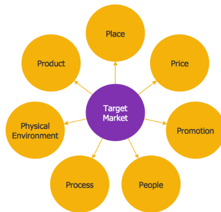
Figure 1. Marketing program is designed with the needs of the target market in mind

We can classify Clickstream Mining and Market Segmentation using Business Intelligence.