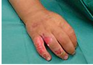
Fig. 5. Normal view of injured skin

easily visualized by thermal images Thermal imaging was also used to investigate the skin temperature at the entry point after shots were fired from 0.22–0.38-calibre handguns. Whiplash injuries gained importance in liability cases after car crashes. Thermal imaging was successfully used as an alternative to Polygraph testing.