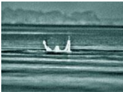
Fig.3. Thermal view in total darkness, a swimmer in distress is found struggling in the water.

A thermal imager can help officers locate evidence at night, especially smaller pieces of evidence. Drugs, money and weapons thrown by a suspect during a pursuit will retain heat from the suspect. As such, they should be easier to locate with a thermal imager once the suspect is apprehended. A