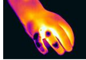
Fig.6. Thermogram of injured skin

In this application, psychological effects on blood flow are investigated, and an accuracy of 78% in detecting deceptive subjects is reported. Thermal imaging can be used as a method of temperature measurement in a number of applications of forensic medicine in order to identify the time to death.