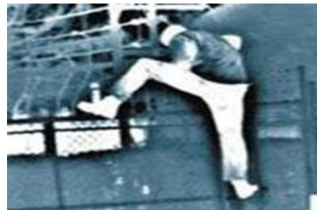
Fig. 4. Thermal view of an intruder in total darkness

Because the thermal imager does not require light and only receives heat energy, it can be used to observe potential criminal activity at a distance. Whether a suspect is dealing drugs on the street, or trying to steal purses and stereos from cars, low-light conditions work to his benefit. An officer can use a thermal imager to observe the suspect from a distance, watching his activity and building further reasonable suspicion or probable cause (Fig. 3 & Fig. 4). The thermal imagery can be recorded for use as evidence later, or it can be used to justify specific interaction with the suspect.