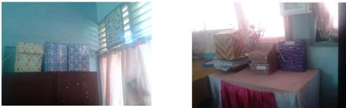
Figure 3. A source of learning in the classroom

The main point of this learning technique is students will have freely feeling by the way they carry out searches each information, and in accordance with their world are still concrete then to see and find their own will more easy to understand and remember. Different from when they have to read the contents of a lesson on the materials by listening to the teacher explanation of textbooks and teachers' notes that sometimes makes them bored.