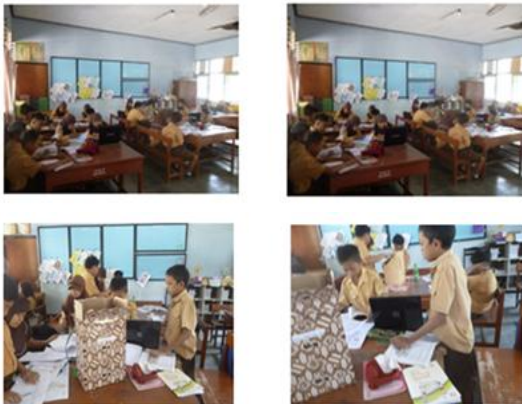
Figure 1. Student Activities

The next steps, students noted all the information of the countries they were visited which then documented in any form they wanted. For example, in form of print out , copy from the book, or even in form of cutouts from newspapers or magazines. All results of the documentation then collected in a bag which made from old cardboard that has been modified to be backpack form. This reason to this technique called backpacker learning technique that means a backpack for all students results in their exploration is collected in their backpacks.