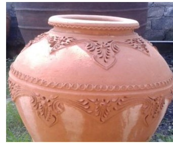
Figure 9. Ornament details