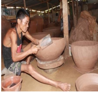
Figure 4. The forming process