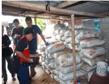
Figure 2. Fine sand as mixer material ingredients