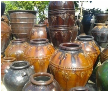
Figure 7. Various color applications

The pottery of Serang Banten produced in Bali vary in size, ranging from 50 cm to 180 cm in diameter and there are up to 100 cm. The actual size of the height can be made better if the furnace fuel is made larger. The furnace fuel the entrepreneurs in Bali when the study was conducted, only enough for burning the pottery with a maximum height of about 180 cm. The other uniqueness can be seen from staining glaze, e.g. is capable of displaying color shades of dull or shiny with a color variety e.g. black, melted chocolate, green, and so on (Figure 7 and 8). The colors are very hard glaze pottery products found in other types of large size, except the pottery products of Serang Banten. Therefore this kind is named a unique pottery of Serang Banten, because of the shape and coloring characteristic capable of displaying a solid impression and strong. The pottery uniqueness makes it is loved by foreigners and the societies in Bali. The societies who enjoyed the pottery products are locals from Bali and outside.