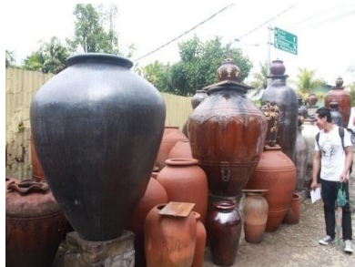
Figure 8. The measure comparing the pottery vs human