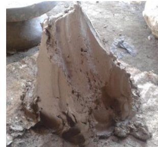
Figure 3. A soil processed ready formed