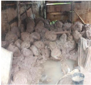
Figure 1. The raw material of clay

However, in Bali the milling process is not done, due to the owners do not have a milling machine. The next process is establishing the pottery body according to the desired design (Figure. 4). The formation result then is dried in the sun for one to two days depending on the size and the body thickness upon a pottery and weather. After the pottery bodies really dry, followed by the combustion process. All items that are ready to be burned fed into the furnace (figure. 5) and neatly arranged. The burning process was begun by entering a firewood to the furnace head and lit with fire. The burning process takes about 10 to 12 hours, in order to the results that were obtained a mature, robust, and waterproof (figure. 6).