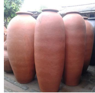
Figure 6. The products of combustion.

Pottery products that require coloring painting process are carried out using tin paint dye from solution. After making burnt to produce the brown colors, green, glossy black, some are flat and it is also melted, and capable of displaying an antique impression (figure 7 and 8). Another finishing watercolor/wall paint and rubbed with talcum powder or rice husk ash using a sponge or cloth to get a dull color.