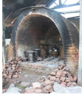
Figure 5. Furnace