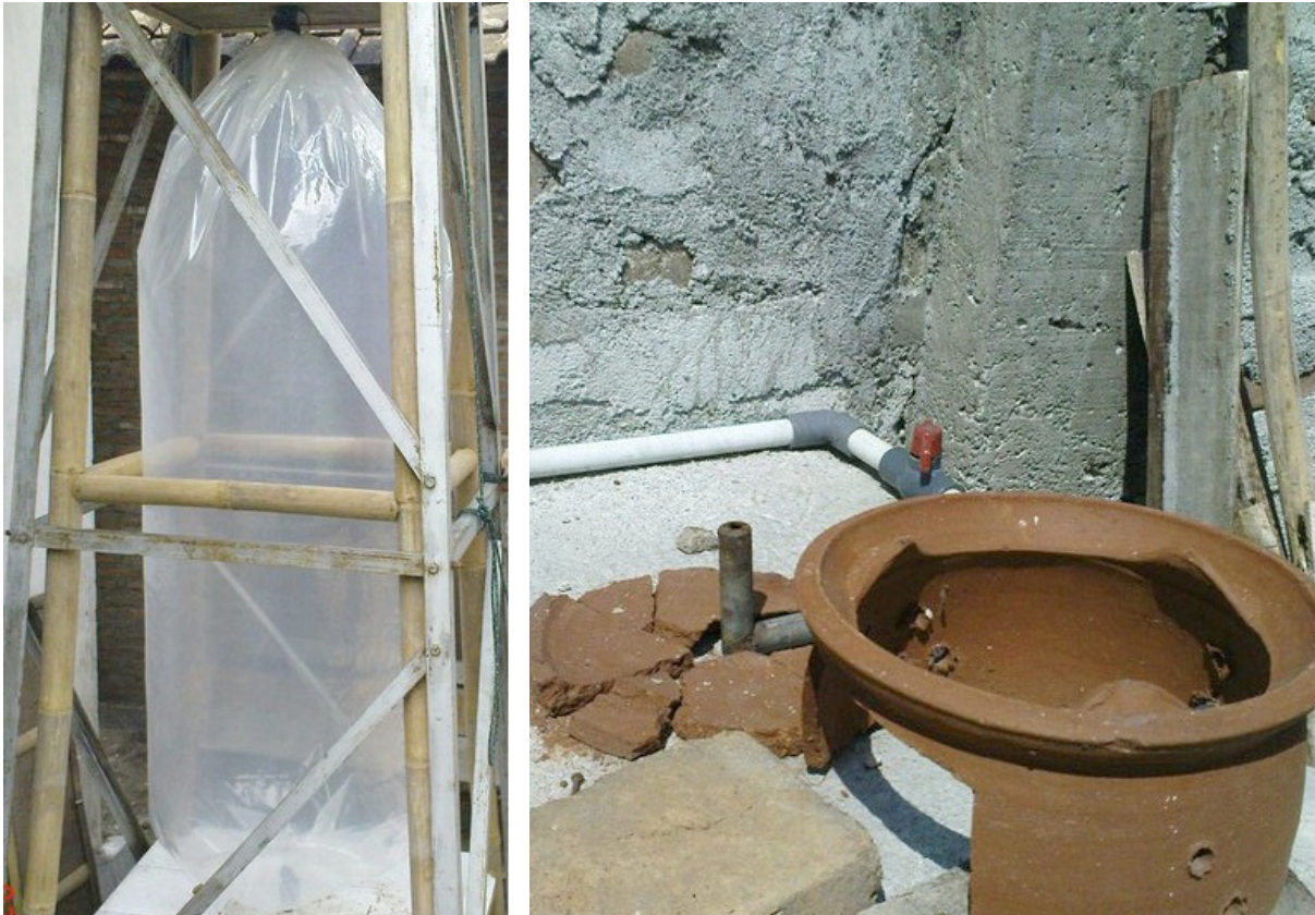
Figure 3. The plastic bag on the left contains methane gas. It is compressed from above by a wooden stick which pushes down the gas. On the right side is the end-channel of biogas used for cooking. A user can adjust the volume of gas as desired.