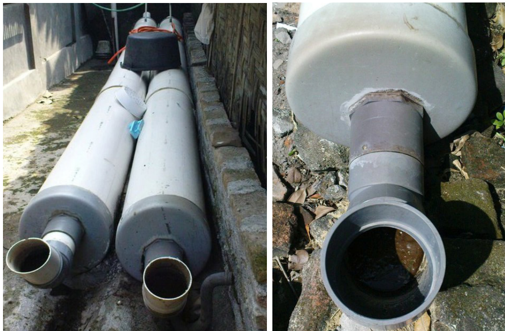
Figure 2. These PVC pipes are used by the community for the digester. They insert cow dung and water and the gasification processing will take from 1 to 2 weeks. Gadjah Mada University Indonesia's student fieldwork program (primarily students from the Livestock Department) introduced this gas plant. Japan International Cooperation Agency facilitated the initial installation by requiring only 30% of the project's capital investment from local people.

not involved in the design-making. The need to uplift the quality of biogas is always at the heart of a/the community, but they must overcome financial constraints, especially for upgrading. The local institution, operated by the community, provides opportunities to disseminate information as well as exchange local aspirations and ideas at regular weekly meetings. By improving their solidarity through lending money, each household is not severely suffering from financial hurdles. However, the local government has not put forward any additional funding, nor have they even visited the site for assessment. More than three times the proposal was delivered to the local government office, but no response appeared. When asked about how government should take action, most people responded that government must be responsible for local livelihood promotion especially when dealing with prosperity and economic improvement.