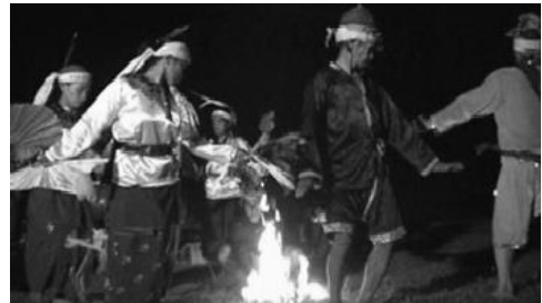
Figure 4. Balia customary ceremony by the Kaili people from the Donggala district of Central Sulawesi for 4th Pasamuan Seni & Ketuhanan/ Sharing Art & Religiosity at the Mandala Wisata Samuan Tiga in Bedulu, Bali, 26 March 2004.

What emerged from sharing art and religiosity inspired by Samuan Tiga was a participatory space generated from traditional and modern art offerings by people of diverse cultures and faiths and a common field for intercultural and interreligious creativity. In 2004, this