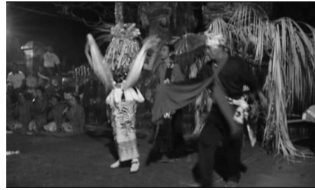
Figure 3. Seblang dance ritual by the Osing people of the village of Olehsari, Banyuwangi region, East Java for 4th Pasamuan Seni & Ketuhanan/ Sharing Art & Religiosity at the Mandala Wisata Samuan Tiga in Bedulu, Bali, 26 March 2004.

realm for prosperity, healing illness, and well-being.