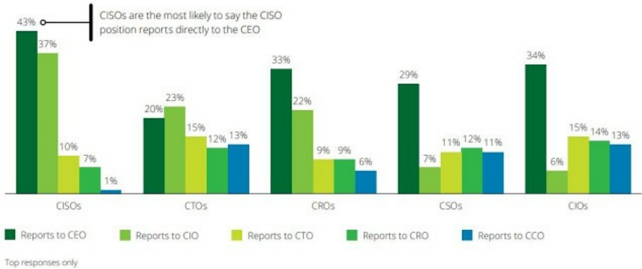
Chart Attribute: Top positions that the CISO typically reports to in a company / Source: Figure 8b, Page 9, The future of cyber survey 2019 Cyber everywhere. Succeed anywhere, Deloitte.

nearly 80 percent of CISOs report to a CIO or CSO. This indication that CISOs are, in fact, directly reporting to a CEO is quite encouraging but counter to Deloitte's experience.