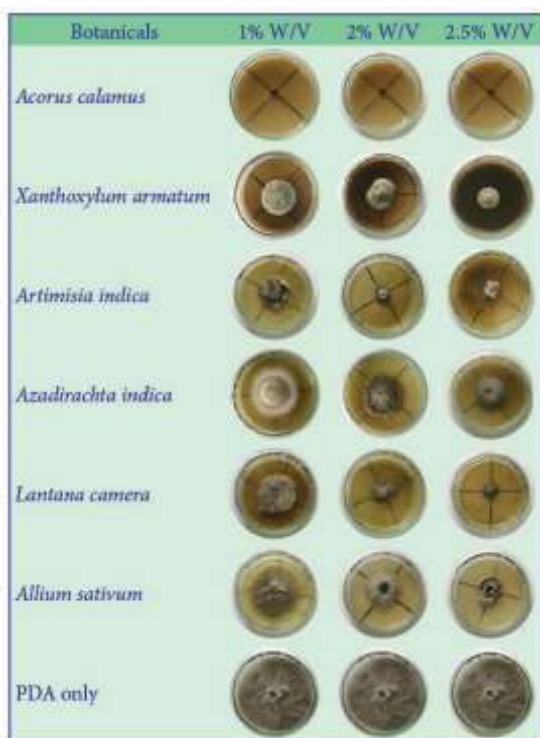
Figure 1. Effect of plant extracts on the growth of E. turcicum in different concentration levels at 25°C during 2017 at NMRP, Rampur, Chitwan