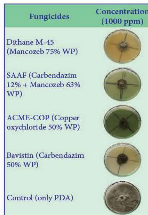
Figure 2. Effect of fungicides on the growth of E. turcicum in different concentration levels at 25°C during 2017 at NMRP, Rampur, Chitwan

The mean colony diameter of the antagonist was significantly higher than the pathogen, E. turcicum , on 5 th day of incubation at 25°C (Table 4). Less (18.60 mm) mean colony diameter of the pathogen was measured when dual culture was done with Trichoderma viride Pers. (PPD isolate). The diameter of the pathogen alone was 28.60 mm on 5 th day of incubation at room temperature. The mean colony diameter of the antagonist T. viride was noticed higher in dual culture with E. turcicum in all days of incubation compared to the diameter of T. viride grown alone in PDA (Figure 3). It was observed that the growth of the antagonist was enhanced in dual culture with pathogen than the antagonist alone grown in PDA while the growth of the pathogen was less in dual culture with antagonist compared to the pathogen grown alone in PDA in all days of incubation.