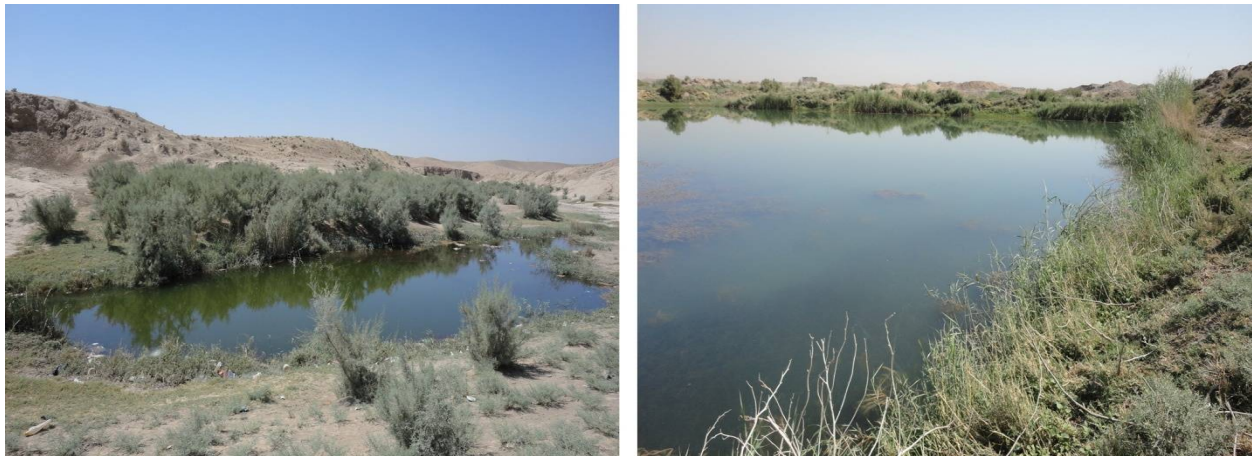
Fig. (2). Kapran pond of plant habitats.