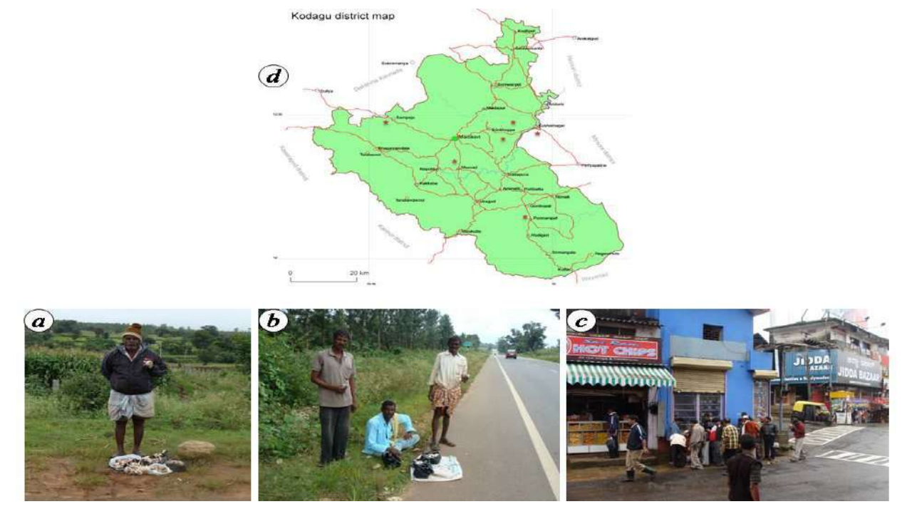
Fig. 1(a). Map of Kodagu district showing the major hot spots regions for Termitomyces Species. 1(b) and 1(c): Local people selling the collected basidiocarps of Termitomyces on roadsides (Kushalnagar) and 1(d): Local marketplace (Madikeri).

Eight different species namely T. microcarpus, T. indicus, T. clypeatus, T. cylindricus, T. globulus, T. eurhizus, T. heimii and T. mammiformis belonging to Termitomyces genera (Fig. 2) were identified based on the key identification features described by Pegler and Vanhaecke<sup>6</sup>, out of which, four species (T, T)microcarpus, T. indicus, T. heimii and T. mammiformis) have been well-known among local communities because of traditional folklore which is believed to have the highest nutritional and economical value. Based on this survey, we were able to identify major hot spots for all species of Termitomyces, which were located in the district (Anekadu and Perambady forests, Alanahalli, Manchadevanahalli, Sampaje, Somwarpet and Hakathur villages). On an average, merchants could collect around 2000 kg of T. Mammiformis only in the belt of Alanahalli and Kushalnagar with an approximate cost varying from 1.5-2$ for mature and 4-5$ for immature once per kg. These hot spots should be rightly named as "The land of Termitomyces" (Fig. 1a), (Table 1) which has a great embedded potency to attract tourist and mushroom lovers. Due to the high nutritive value, lowfat, high fiber, rich in protein, minerals (Ca, P, K), vitamins and nutraceutical properties of these mushrooms has created an interest in local communities<sup>7</sup>. In monsoon, this mushroom becomes one of the major components of serving dish in all villages of this region.