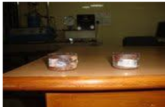
Fig. 3. Circular keen box for water holding capacity of fly ash.

carbon was estimated by the rapid dichromate oxidation method (Walkley and Black, 1934). Cation exchange capacity was determined by extraction with 1N sodium acetate, followed by washing with 95% ethanol and leached with 1N ammonium acetate solution and measured by a flame photometer (Jackson, 1973). Available nitrogen was determined by the alkaline potassium permanganate method (Subbaih and Asija, 1956).