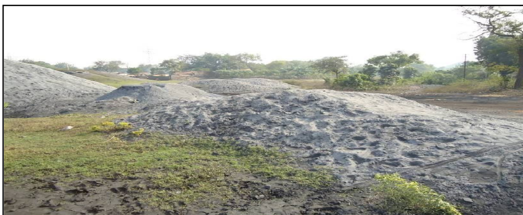
Fig. 2. Simple view of fly ash, TISCO power plant, Jamadoba.