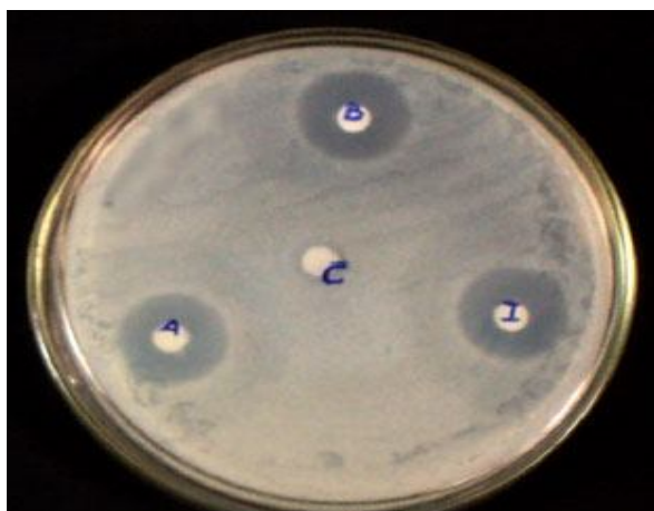
Fig. 1. Bacillus sp. JSGT Showing protease production by zone of hydrolysis.

In this study 8 bacterial strains were isolated from decaying skin sample suspension processed on nutrient agar medium. The objective of the study was to isolate and identify haloalkalophilic microorganism having the potential to secrete enzyme of extracellular proteolytic activity. Out of 8 isolates, three exhibited vibrant zones of clearance on 1.0 % skim milk agar medium at pH 9 as shown by Bacillus sp. JSGT (Figure 1). These isolates were identified and were represented by the genus Bacillus , Pseudomonas and Aspergillus as shown in Table 1. This shows that Bacillus sp. is ubiquitous and endures the extreme conditions of saline.