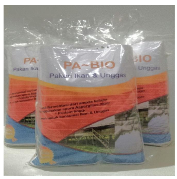
Figure 1. Feed "PA-BIO" in packs of 1 kg

Ways of feeding the coconut dregs on poultry: use the fermented feed about 3% of the weight of poultry. Give to the poultry in the morning and evening.