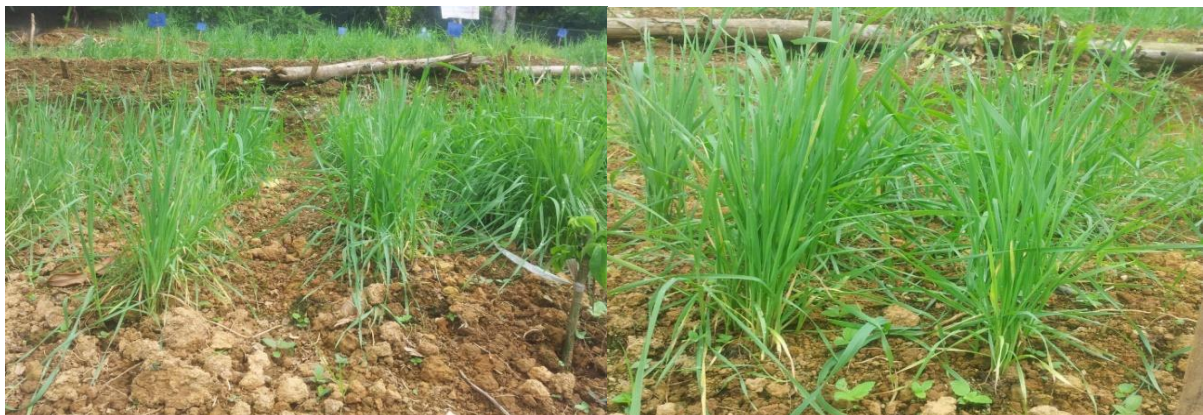
Figure 3. Morphological Performance of Wheat in Medium Land

Genotype performance in medium land is depicted in Figure 3 which shows that the performance for vegetative character ( \pm 3 months). The difference of performance between Guri 4 and Guri 6 variety which used conventional and Hazton cropping system was caused by environmental condition which particularly included the effect of intensity and duration of radiation, effect of temperature, and water availability in the environment where plants grow (Glover, 2007).