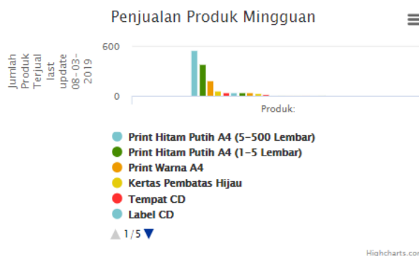
Figure 3. Weekly Sales Chart

From the picture above there is information on the sale of goods that are needed by students for a full day.