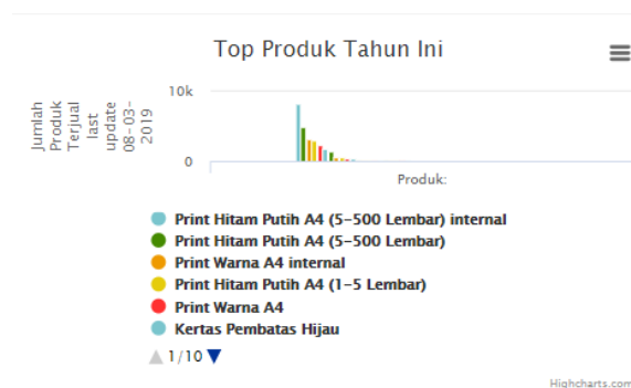
Figure 5 Annual Sales Graph

From the picture can be taken an information item that is most often ordered by students to meet their needs for 1 month.