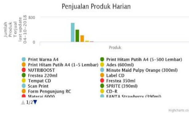
Figure 2. Daily Sales Chart

From the graph contained in the viewboard, the admin can see information on sales needs that are often purchased by students.