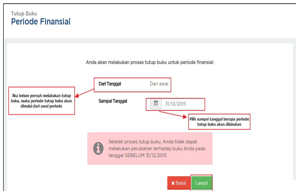
Figure 2. Determining the Period Closing

In this account list menu, contains a number of accounts used for the accounting process, from cash, bank accounts, corporate debt, expenses, income, etc. as a company's financial mapping account.