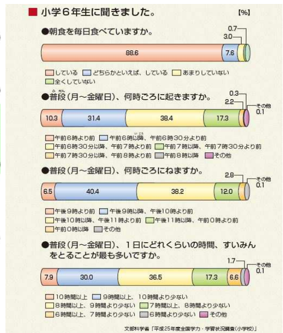
Figure 2 Moral Intrapersonal of Japan Elementary Students (Source: Monbukagakusho, 2009)