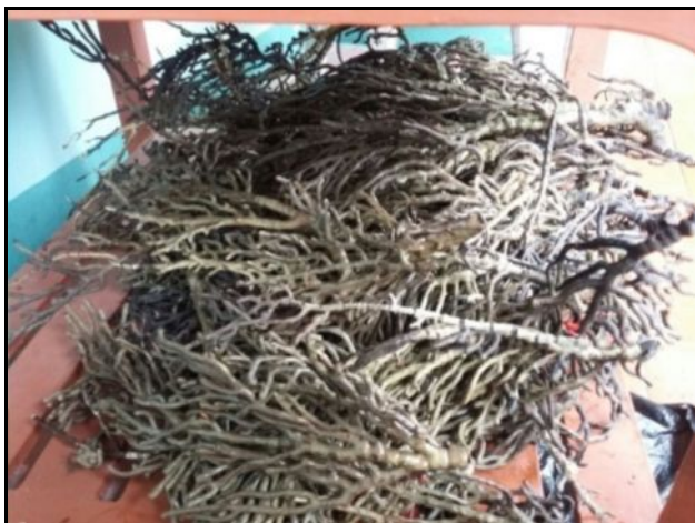
Figure 1. Sea Bamboo ( Isis hippuris ) from Biak Sea, Papua

able to counteract the effects of free radicals. Negative effects caused by free radicals include premature aging, coronary heart disease and cancer 9 .