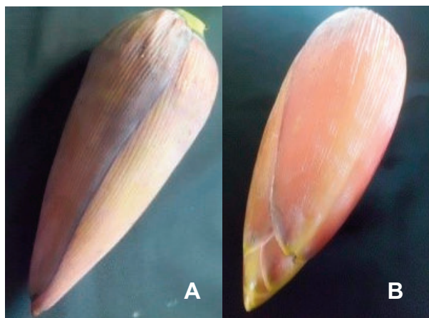
Figure 1. The banana flower as sources of antiviral from Sleman (A) Ambon banana, (B) Klutuk banana

Test results (Table 1) showed that all treatments of extract had no effect on lesion average. However, each treatment of extract can reduce the formation of local lesions on the leaves. The inhibiting power of Klutuk banana flower extract was 91.22% and Ambon was 86.34%. Similarly, the inhibitory power of each extract treatment was significantly different from the one without extract (Figure 3).