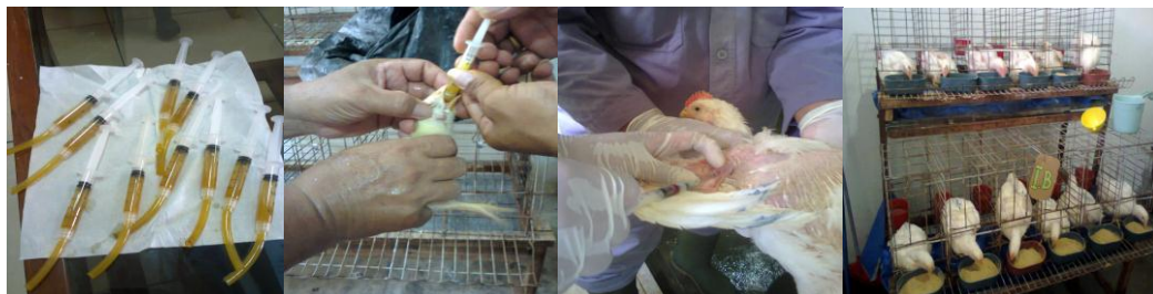
Figure 2. Application of jamu in chickens Gambar 2. Aplikasi jamu pada ayam

Serum antibody titer is the indicator of humoral immunity. This experiment results showed that the antibody titers only in the third group at each time point were higher than that from control group. Suggesting that they could promote humoral immunity and that the maintenance time of their effects was the longest. The third formula promote the production of antibody in the immunosuppressant animals and could enhance the antibody titer of ND vaccine.