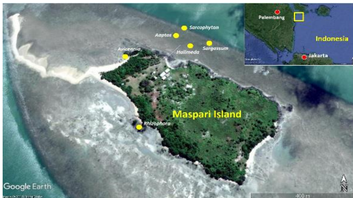
Figure 1. Sampling location of marine biota.

Bacteria isolates used for the test were six isolates of Vibrio sp. (with code V. spp1 to spp6 ), isolates were isolated from Vannamei sp. shrimp ponds at shrimp farming location in Sungsang, South Sumatra. In addition, the performance is also tested on the bacteria S. aureus and E. coli using Nutrient Broth (NB) and Nutrient Agar (NA) growing media. Inhibition test is done with agar diffusion (10.000 ppm for extract concentration). The extracts were tested using paper disks and solvents as controls with repeated three times (Rozirwan et al. , 2015).