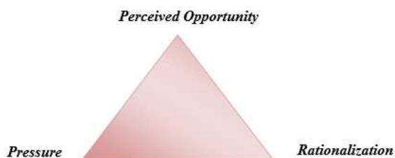
Figure 1 Fraud Triangle

Based on the company's internal point of view, fraud occurs from the responsibility for its prevention is not the usual task since dishonesty is accepted as unavoidable, cases known to be unpunished, so the disease continues to spread; Because security is considered too expensive or covered by loyalty (Salem 2012). Also, the fraudulent triangle model developed by Donald R. Cressey can also be an answer to the question of how fraud can occur. Until now, this model is still often used as a classical model to explain fraud at work or associated with occupation (occupational offender) (Tuanakotta 2013). This fraud triangle can be seen in figure 1.