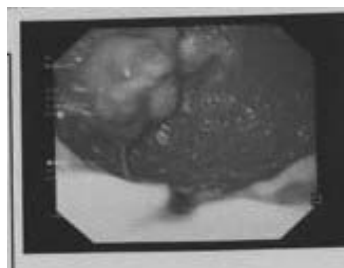
Figure 2. Endoscopic image of post injection of histoacryl intra-varices

Post-injection, patient was evaluated and there were no complaints of chest pain, tightness, or bleeding