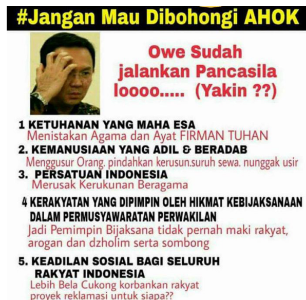
Figure 8.

Although hoaxes may fit different categories, with differences in discourses, these comparisons do not usually enter the symbolic area. For example, when comparing two characters, if one is a blasphemer then the the other one is religious. Comparisons can also include other things; one being hard and arrogant