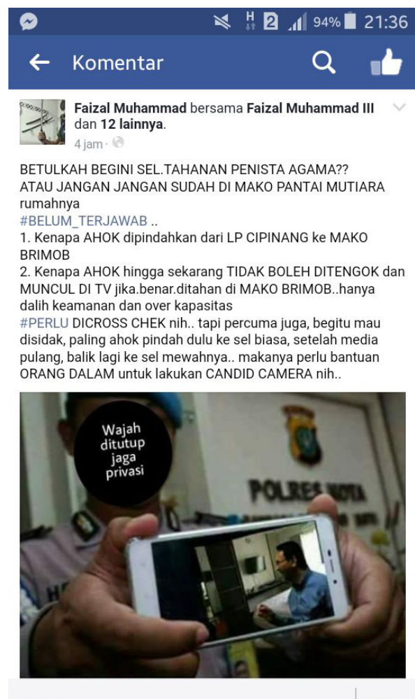
Figure 3.

As already known, memes usually go viral on social media in the form of pictures and writing (visual-verbal memes), although some also take audio visual form. Hoaxes on iconic aspects, for example, may replace faces, backgrounds, and other objects that can directly refer to reality to suit their purpose. This type of deception happens quite often. Take, for example, the viral hoax that begins "Is this really a prison cell for a blasphemer? Or maybe he's moved to Mako Pantai Mutiara?"