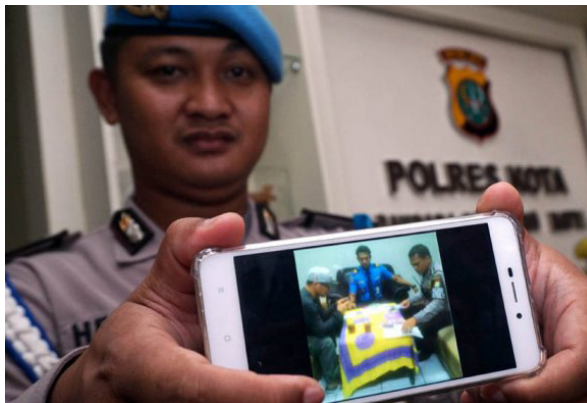
Figure 4.