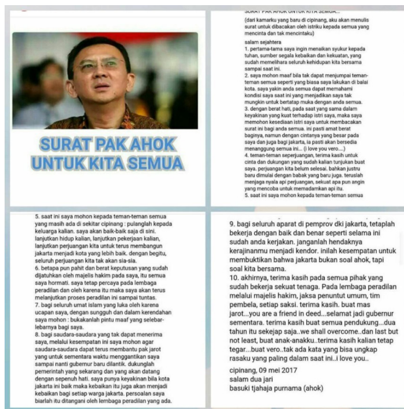
Figure 7.

It must be emphasized, first , that not all hoaxes intervene in the collective understanding and recognition of difference. Many observers have paid too much attention to anti-diversity hoaxes, especially those with contents that ideologically and symbolically disturb others' "beliefs and feelings", which are usually referred to as hate speech. Hate speech targets certain groups as being guilty, despicable, unbelieving, hypocritical, and dishonest, while other groups are positioned as right, pure, religious, sportsmanly, and honest. These groups are