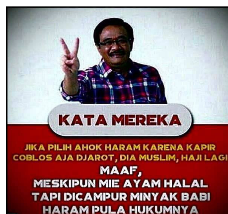
Figure 1.

In simple terms, several practical rules can be used to identify hoaxes, as delineated by Hartley (2012). First, hoax information usually has the characteristics of chain letters, including sentences such as "Spread this to everyone you know, otherwise something unpleasant will happen." Second, hoax information usually does not include the date of the incident discussed, or other realistic or verifiable information, using statements such as "yesterday" or "issued by ..." that lack clarity. Third, hoax information usually does not include an expiration date, even though the presence of such a date would not prove anything. Fourth, no identifiable organization is cited as the source of the information, or an organization is identified that is usually not related to the information being shared. Anyone can say, "I heard it from someone who works at Microsoft" (or another well-known company). However, the shape, nature, format, and appearance of hoaxes have recently been far more sophisticated than what Hartley has formulated.