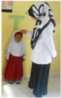
1. Agent to promote and increase health status of school children.