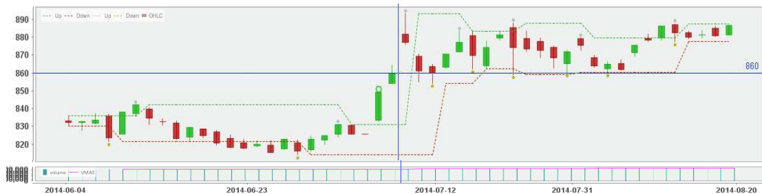
Figure 1. LQ-45 Stock Price Movements Graph

price. It means that this event has relationship to the stock price of LQ-45 whether to make it increasing or decreasing. The data of both colored cells show that there is a change in stock price before and after the 2014 Indonesian presidential election.