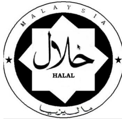
Figure 1. The halal logo applied in Malaysia (Bin Abdullah, 2010).

Sadek (2001), states that the desire among Moslem consumers to eat only halal food made it incumbent upon Malaysian government to enact laws, procedures, and guidelines with regards to halal good, the passage of Trade Description (use of expression “halal” ) Order. 1975 and Trade Description Act (Halal Sign Marking ) 1975 makes it an offence to falsely label the food as halal, also for the use of the halal sign on the specific food products when actual sense it is not. Plus, under section 3 it is mentioned that if a company or person who does not apply the halal meaning and procedure but put the halal logo at their restaurant or products will be considered as a criminal.