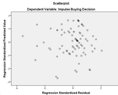
Figure 2. Classical Assumption Normality Test