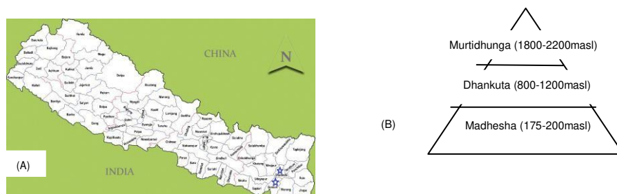
Figure 1. Map of Nepal showing studied districts depicted with star signs (A), and altitudinal locations of the study area (B).

For the present study, three locations of eastern Nepal belonging to two districts (Figure 1A) of eastern region were selected because these places were known to possess relatively higher density of buffaloes. The study locations were differentiated into three agro ecological zones to know the variation of prevalence representing - high hill, mid hill and lowland or plain (tarai). The highest altitude from where samples were collected located at the range of about 1800-2200 meter above sea level (masl) in Murtidhunga (high hill, 27° 09' 64.87" N; 87° 36' 37.94" E); 800-1200 masl in Dhankuta (mid hill, 26° 97' 09.96" N; 87° 34' 31.09" E) of Dhankuta District and 175-200 masl in Madhesha (low land, 26° 63' 43.79" N; 87° 18' 60.72" E) of Sunsari District. Farmers raised buffaloes as semi-intensive type of management. Majority of farmers offered straw and grasses as feed. Only limited farmers provided commercial feed along with local feed materials to buffaloes.