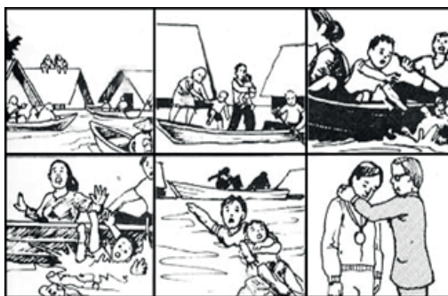
Figure 2. Sample activity: Week 4: Picture story: Put the pictures in order (Each frame is given to a different student and they put the story in order verbally without showing the pictures).