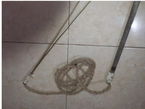
Fig. 3- The shape of pecut