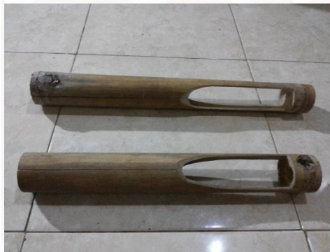
Figure 1. Two shapes of kepuakan

Kepuakan : This acoustic tool is made of local bamboo materials and when played can produce single or consecutive clapping sound. Types of bamboo commonly used in the made of the tool are a tali bamboo ( Giganlochloa apus ) and jajang bamboo ( Giganlochloa ridleyi ). Kepuakan from Tabanan and Badung are made using only tali bamboo while for Gianyar using jajang bamboo as an alternative other than tali bamboo. The size (dimension) of the tools varies according to the types of bamboo used, the length is 39-75 cm, the diameter is 5-6 cm and the thickness is 0.4-0.6 cm. The tools are made by cutting a bamboo segment and splitting one end into two parts to form the same parts. At the other end is partially removed which is intended as a handle when the device is played. This tool can be played with one or two hands while walking around the rice fields. Kepuakan can be played by all ages, small children to adults, men, and women. Kepuakan can be played in large quantities by installing each of these tools on bamboo stalks along the rice fields and connecting them to each other using a long string. When the connecting rope is pulled-out then the whole tool will sound so that it can give noise effects along the rice fields. There are generally two shapes of kepuakan , namely the shape of the segment and without the segment as shown in Fig. 1.