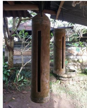
Fig. 4- Two tools of kulkul