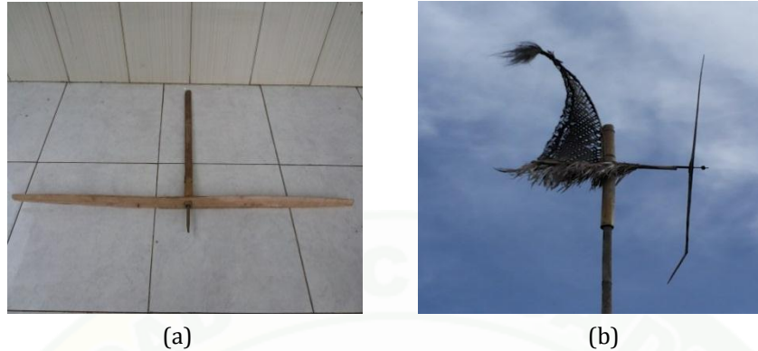
Figure 2. The basic shape of pindekan and Installation of pindekan complete with accessories

The shape of the pindekan before being installed and after installation on long bamboo complete with accessories and tail as the wind direction steering is shown in Figures 2.