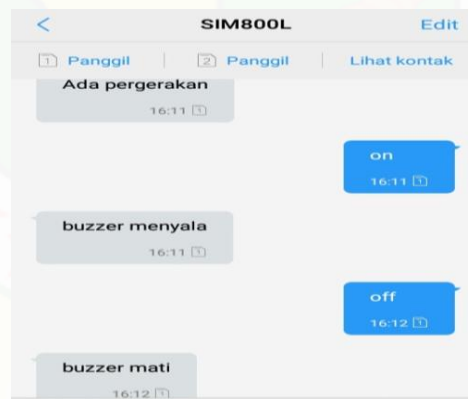
Figure 3. Display text on mobile

If the PIR sensor detects movement, the ATmega328 microcontroller will execute the program and SIM800L will send a message to the cell phone in the form of text that says "there is movement". If from the mobile phone sends a reply to the text in the form of a text message that says "on" then the speaker from isd will sound according to the previous recorded followed by a buzzer, then there will be a message into the mobile in the form of text that reads "buzzer on". Furthermore, if from the mobile phone sends a reply to the text in the form of a text message that says "off" then the buzzer which initially sounds will stop ringing, then there will be a message entering the cellphone in the form of text that reads "dead buzzer". The text display on the cell phone is shown in Figure 3.