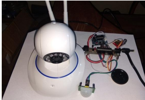
Figure 2. Tool design using PIR sensor and ATmega328 microcontroller to improve online CCTV work

The tool design results obtained from this study are as shown in Figure 2. The use of PIR sensors and ATmega328 microcontrollers to improve online CCTV work. The PIR sensor will only issue logic 0 and 1, logic 0 will occur when the sensor does not detect any changes in motion and logic 1 when the sensor detects a change of movement.